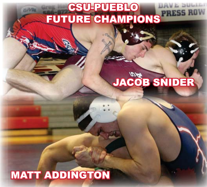
CSU-PUEBLO FUTURE CHAMPIONS